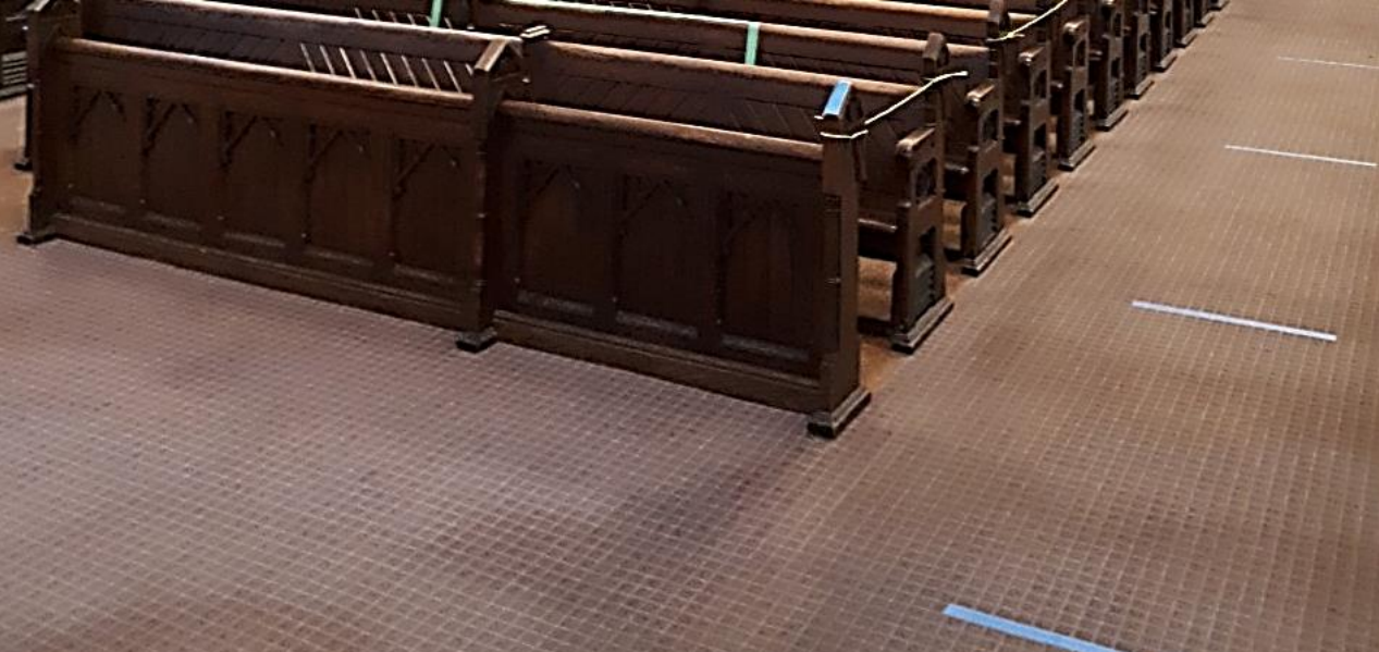
Blue Markings on the floor designate the 6 feet physical distancing in all aisles.