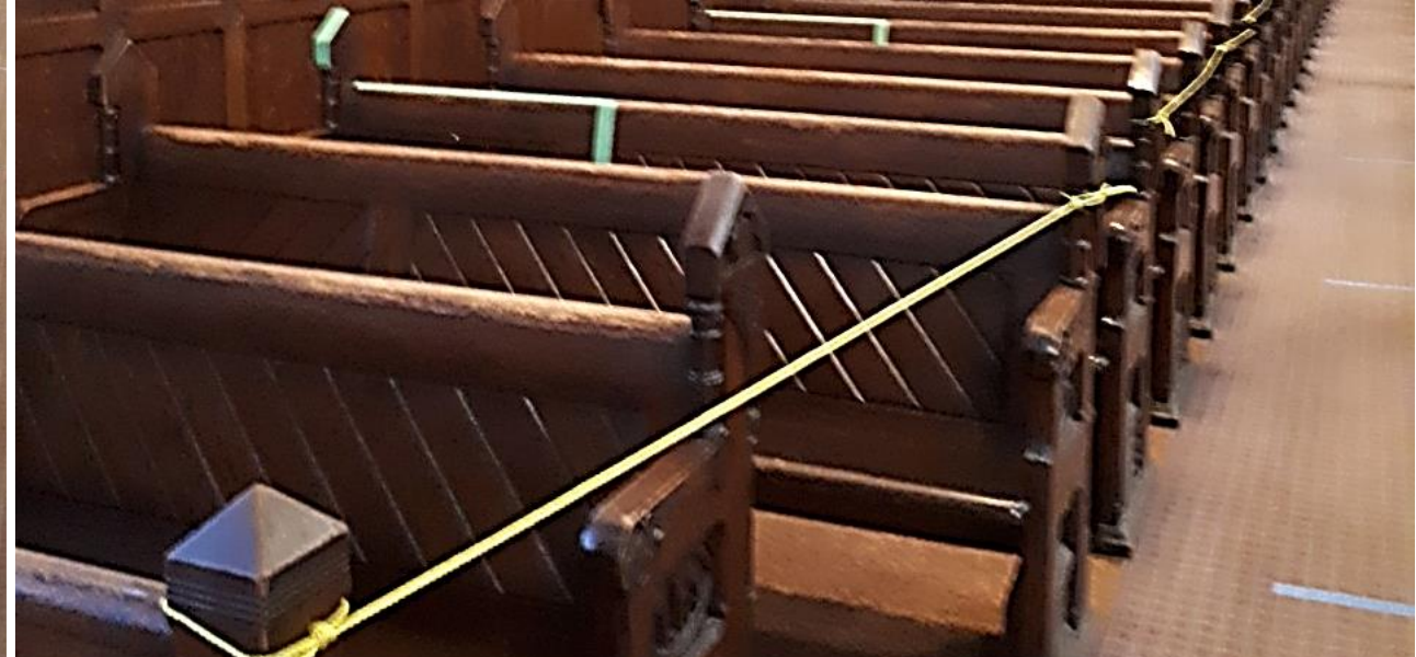
Yellow rope is used for pews that are not being utilized.